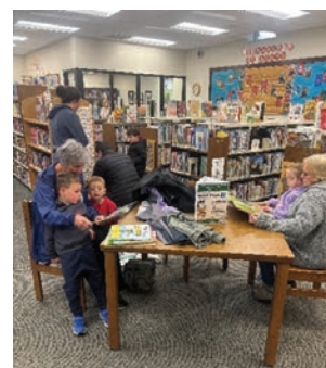
Caregivers and children bond while reading at the library.

Explore a diverse range of programs suitable for all ages, including Dungeons & Dragons and Crochet What!? Throughout the year, we also offer numerous activities, from crafting to new experiences that enrich your life. Stay updated on all the library's events by signing up for our free e-newsletter at kutztownlibrary.org .